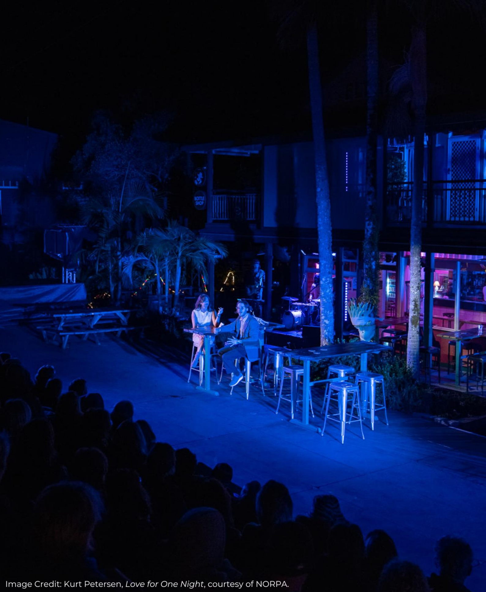
Love for One Night, courtesy of NORPA.